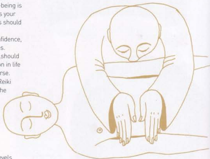
Practising Reiki will encourage your mind to become calmer, which in turn reduces feelings of stress

move onto another level. You must only move up a level when you feel ready to do so - some people never reach level II but still achieve wonderful results for themselves and others. The body's energy cannot differentiate between you receiving a Reiki level I, II or III certificate.